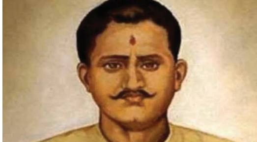
Born: 11 June 1897, Martyr's Day: 19 December 1927

On December 19, 1927, when the British were taking some youths for execution they were humming patriotic songs like 'Sarfarooshi Ki Tamanna ab Hamara Dil Mein hai' and 'Mera rang de Bansi Chola'. Among these youths, there was a 30-year-old youth whose name was Pt. Ram Prasad Bismil. Born on June 11, 1897, in Shahjahanpur, Pt. Ram Prasad Bismil was one of the most notable Indian revolutionaries in the struggle against British colonialism. Bismil started participating in the freedom movement at the age of just 11.