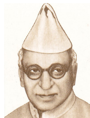
DR SAIFUDDIN KITCHLEW, A FRONTLINE FREEDOM FIGHTER, AN ADVOCATE OF HINDU-MUSLIM UNITY IS REMEMBERED AS THE FACE OF THE PROTESTS AGAINST THE ROWLATT ACT THAT THE BRITISH PASSED IN 1919

When the British government passed the Rowlatt Act in 1919, Dr. Kitchlew, a lawyer by profession and a supporter of Hindu-Muslim unity, raised a strong voice against this Act. Actually, through this law, the government could arrest any person without a warrant. There was a protest against this law across the country. To protest it, Kitchlew urged the people to take part in the strike and non-violent satyagraha against the British government. It was because of Kitchlew's appeal that about 30,000 people attended his public meeting on 30 March 1919, where he delivered a powerful speech. After this, Dr. Kitchlew and Dr. Satyapal led an anti-government procession in Amritsar on 9 April 1919. Following this, both these leaders were arrested and placed under house arrest in Dharamsala. Born on January 15, 1888, in Amritsar, Dr. Saifuddin Kitchlew graduated from Cambridge University and obtained a Ph.D. from German University. Kitchlew took an active part in the Indian freedom struggle and participated in the non-cooperation movement led by Mahatma Gandhi. Besides, he also played an important role in the Khilafat movement. He was one of the founders of Jamia Millia Islamia in Delhi. He also played a guiding role behind the Naujawan Bharat Sabha, founded by Bhagat Singh. Post-Independence, he continued working for the restoration of peace and redefining Soviet-India relations. He became the first Indian to be awarded the Lenin Peace Prize in 1952.