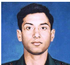
Lieutenant Manoj Kumar

During Operation Vijay, Lieutenant Manoj Kumar Pandey of the 1st Battalion of 11 Gorkha Rifles was assigned the task to clear Khalubar Ridge in Batalik, Jammu, and Kashmir. On 3 July 1999, as his company advanced, the enemy started firing heavily at them. He fearlessly attacked the enemy, killed four soldiers, and destroyed two bunkers. Despite injuries to his shoulder and legs, he first approached the bunker and killed two enemy soldiers in a fierce encounter. He continued to lead his team in capturing one bunker after another before getting fatal wounds on the head. Encouraged by his indomitable courage, his troops continued to attack the enemy and eventually captured the post. Lieutenant Manoj Kumar Pandey was posthumously awarded the Param Vir Chakra for his outstanding heroic deeds and supreme sacrifice.