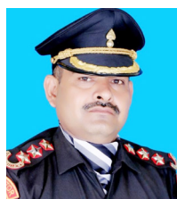
Grenadier Yogendra Singh Yadav

During Operation Vijay in Kargil, Yogendra Singh Yadav was part of the deadly 18th Grenadiers platoon tasked with capturing Tiger Hill Top in Dras, Jammu, and Kashmir. On July 3, 1999, amid heavy shelling by the enemy, alongwith his team he climbed the icy cliff and demolished the bunker, allowing the platoon to climb it. Displaying exemplary courage despite being hit in the lower abdomen and shoulder with three bullets, he attacked and demolished another bunker, killing three Pakistani soldiers. His inspiring valiant act motivated his platoon to attack other targets and finally recapture Tiger Hill Top. Grenadier Yogendra Singh Yadav was awarded Param Vir Chakra for displaying indomitable courage and bravery of the highest order.